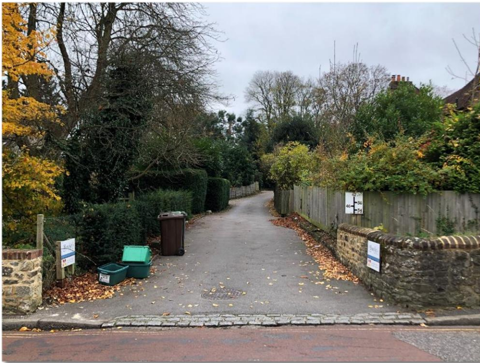
Entrance to St Benedict's Centre car park

If you need any help with transport or you would like to car share, please let us know.