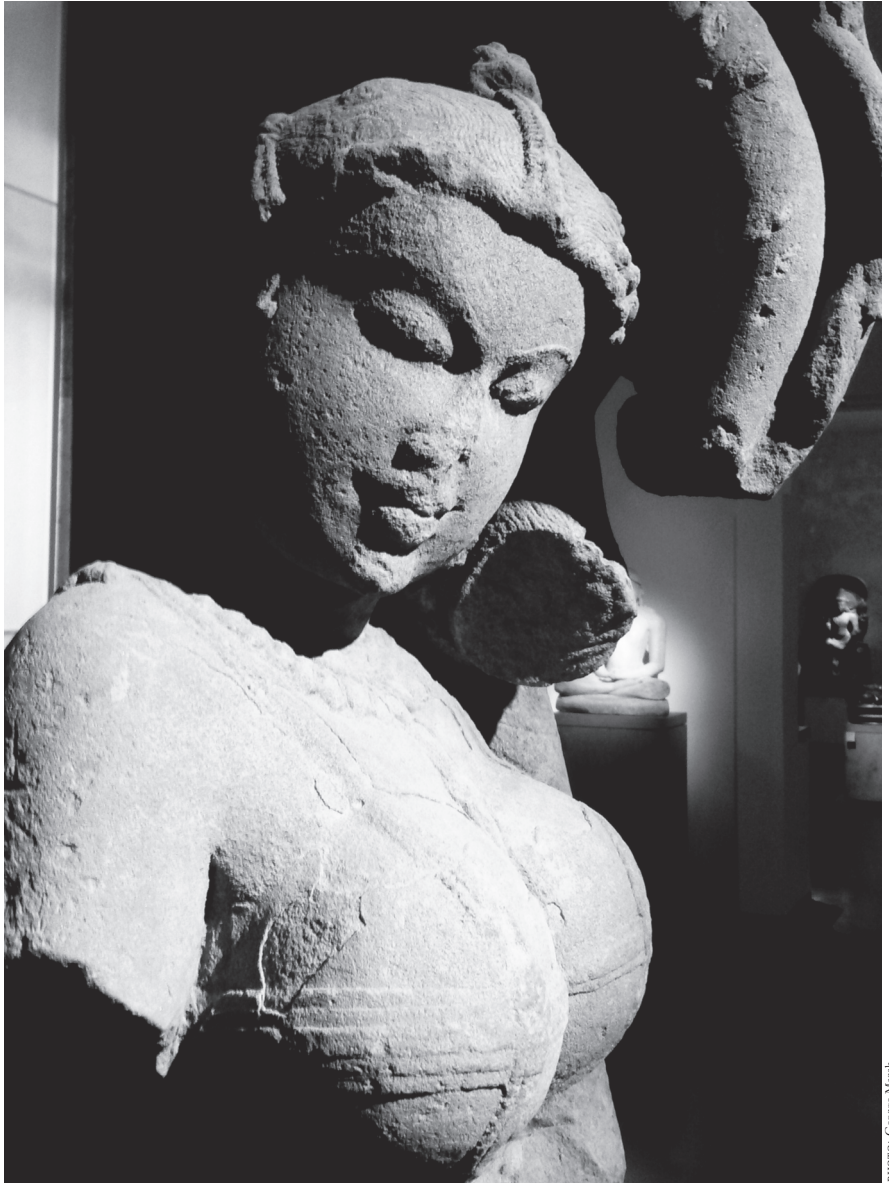
TREE GODDESS, INDIA, 10TH CENTURY