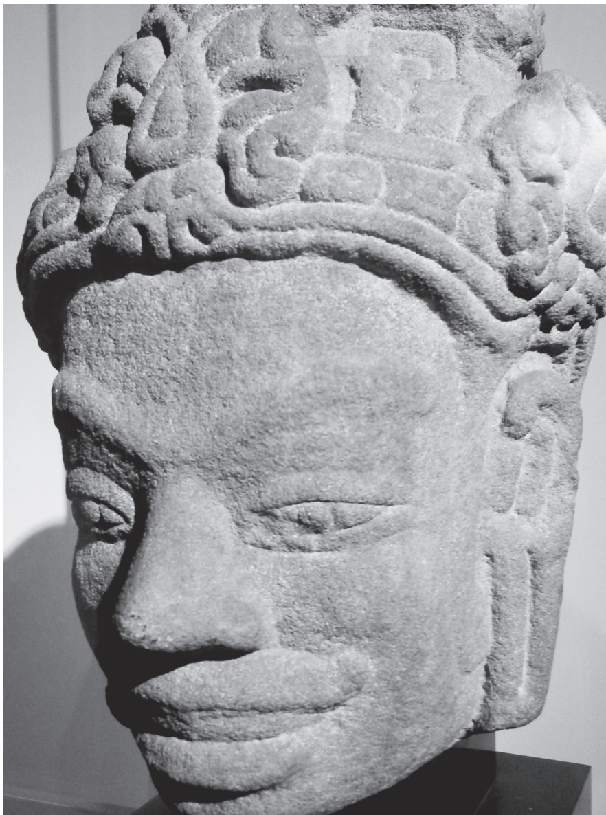
BODHISATTVA, VIETNAM 9TH CENTURY