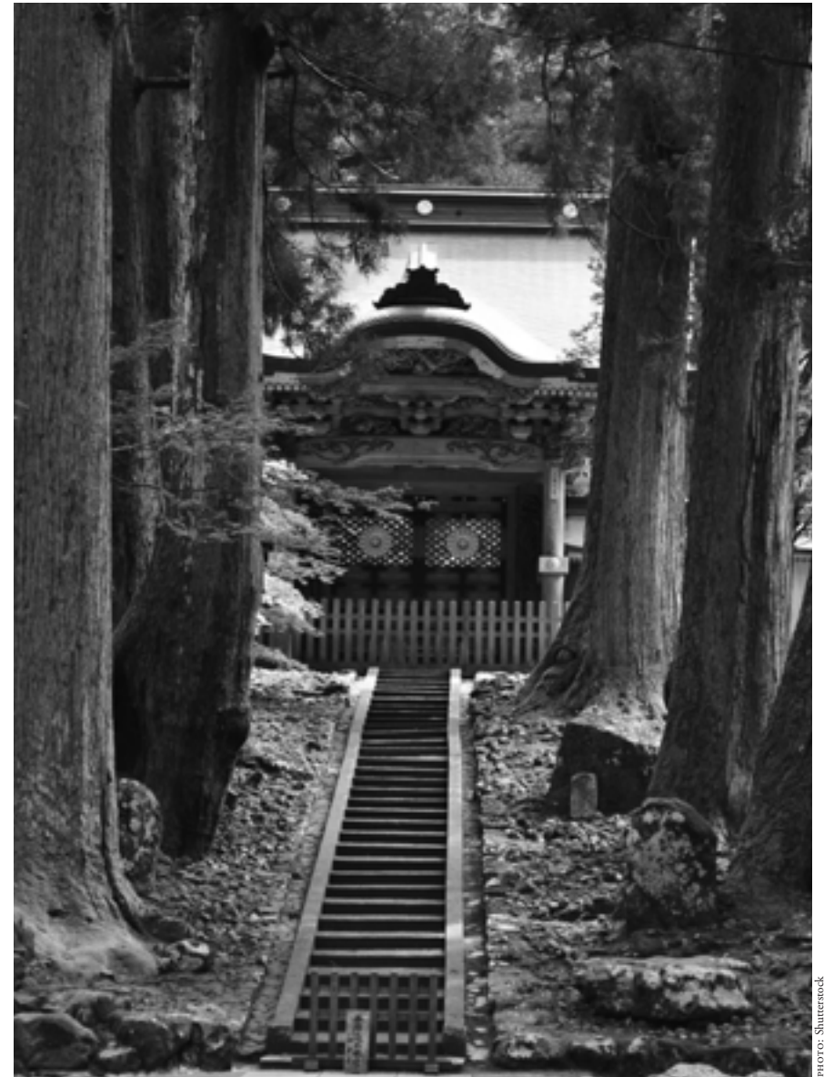
EIHEIJI TEMPLE, FOUNDED BY DOGEN IN 1241