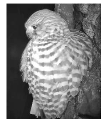
FEMALE KESTREL (INFRA RED LIGHT)